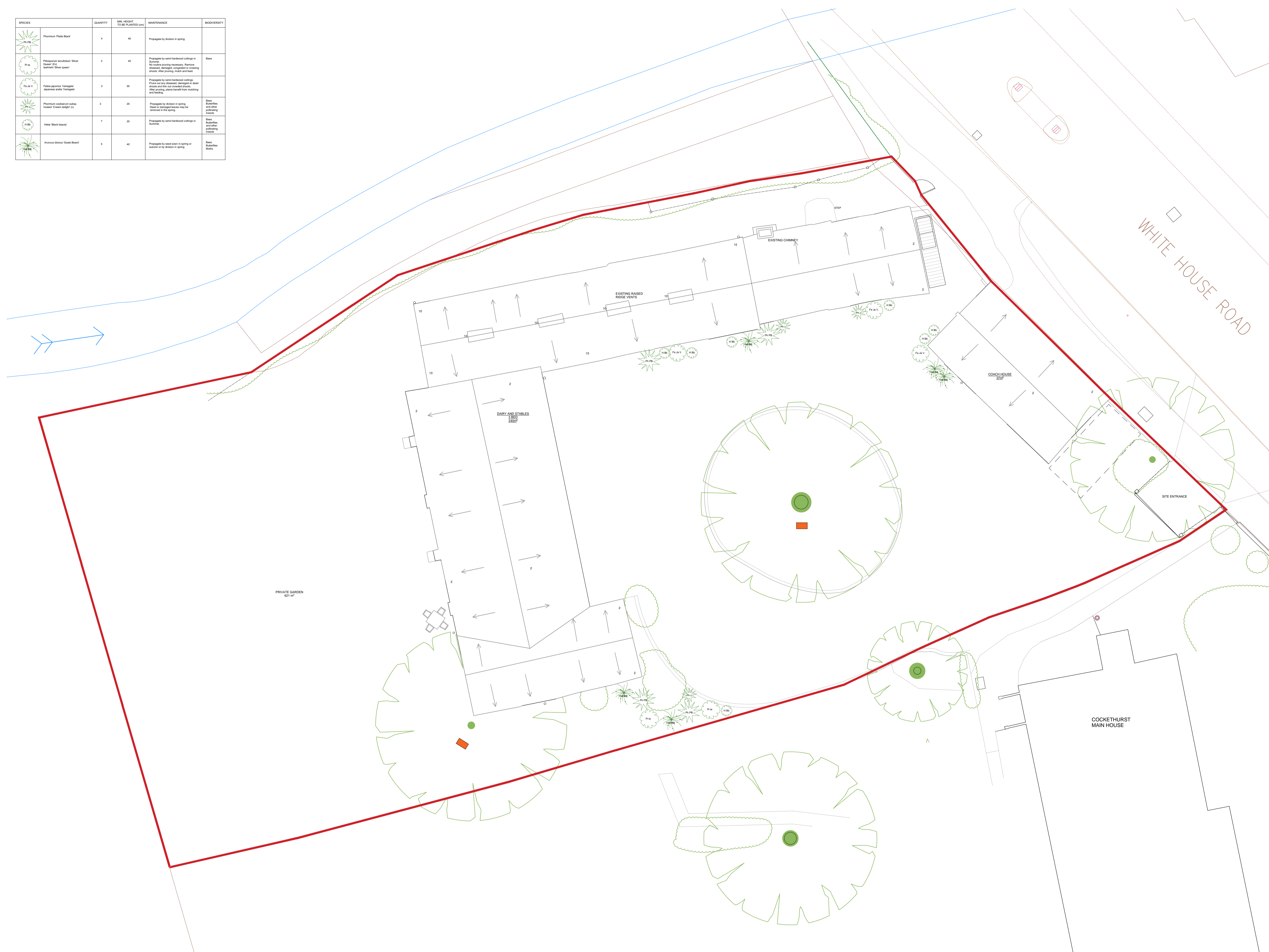
Proposed Roof Plan and Landscape Schedule 1:100